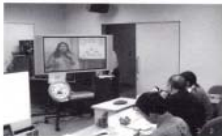
<At JICA-Net Okinawa Studio>

In order to maximize the Effectiveness of training, the use of the remote technical assistance system will be based on sufficient Compact Disk-based educational materials.